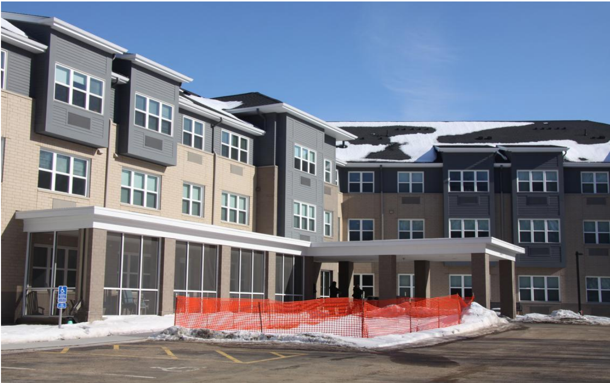
The exterior of The Glen at Valley Creek, an affordable senior housing development, pictured Feb. 5, 2020, in Woodbury.

in closets and wide hallways and doorways. The Glen is also across from the Tamarack Nature Preserve and positioned a short drive or trail walk to the YMCA, R.H. Stafford Library and several shopping and dining options.