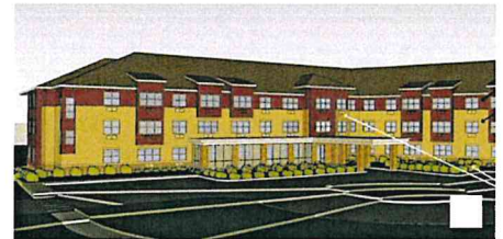
CERMAK RHOADES ARCHITECTS