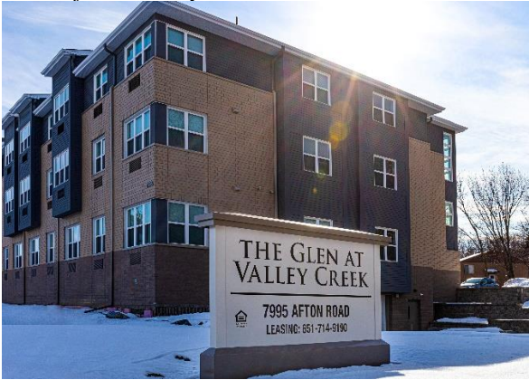
View from Entry Drive