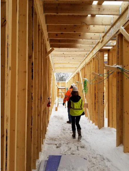
Snow and Rain Construction Status Visits