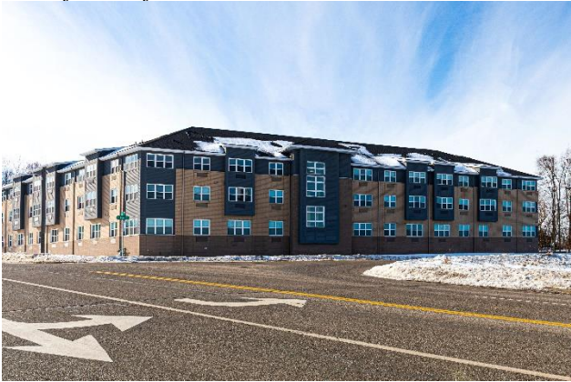
View from Afton Road and Tower Road