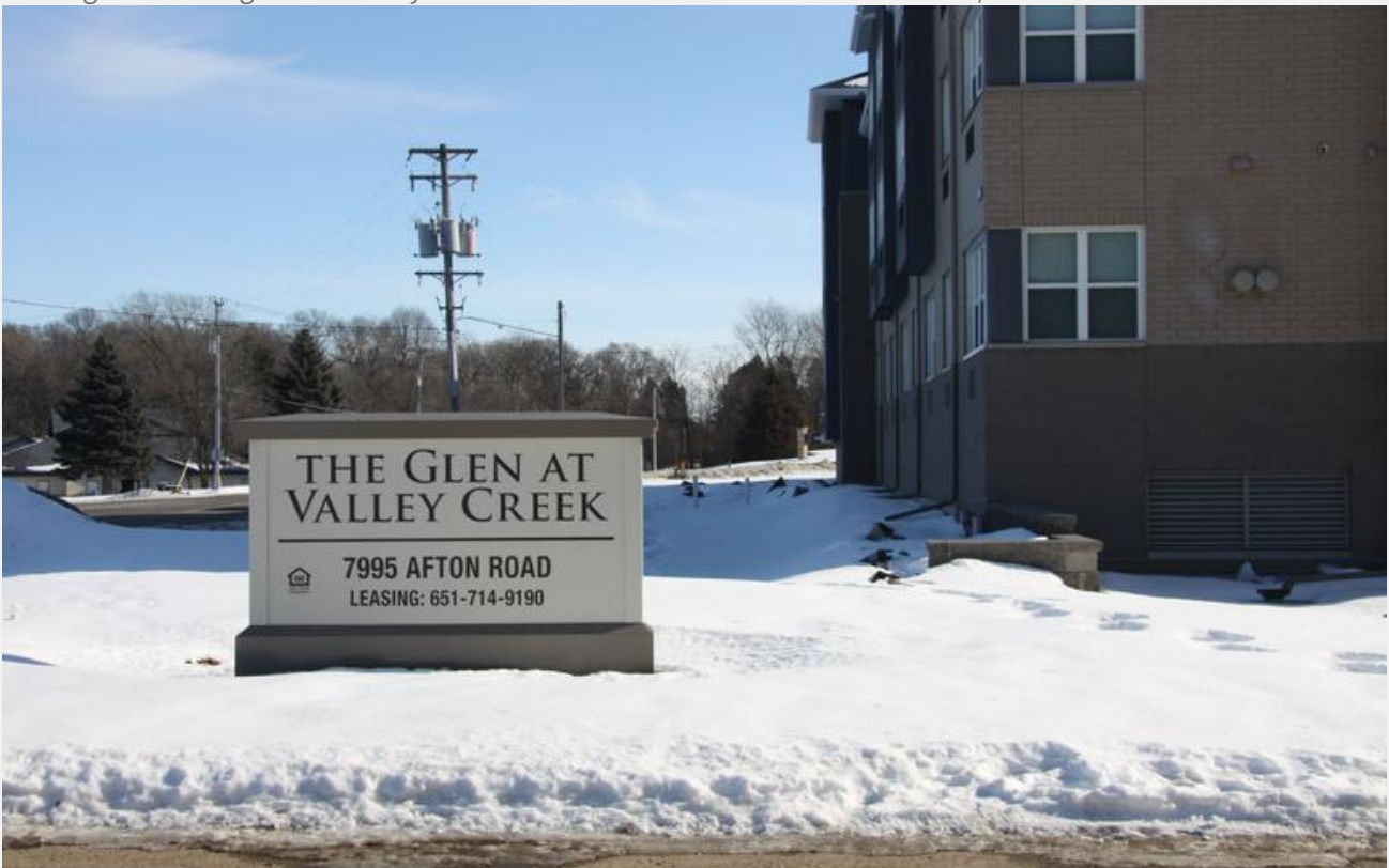
6 / 6 The exterior of The Glen at Valley Creek, an affordable senior housing development, pictured Feb. 5, 2020, in Woodbury.