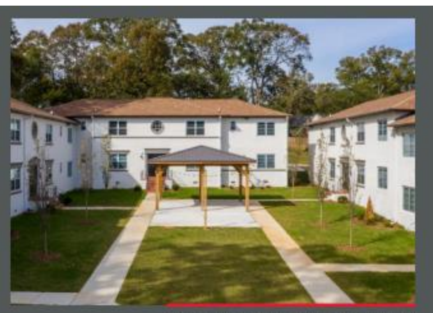
Buildings and courtyard nearing completion